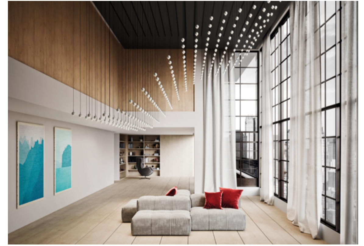
SNOOKER | MODELLING WITH GRAVITY LIFT