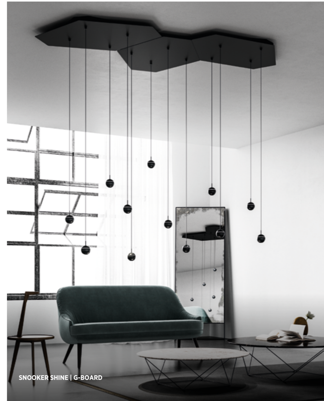
SNOOKER SHINE | G-BOARD